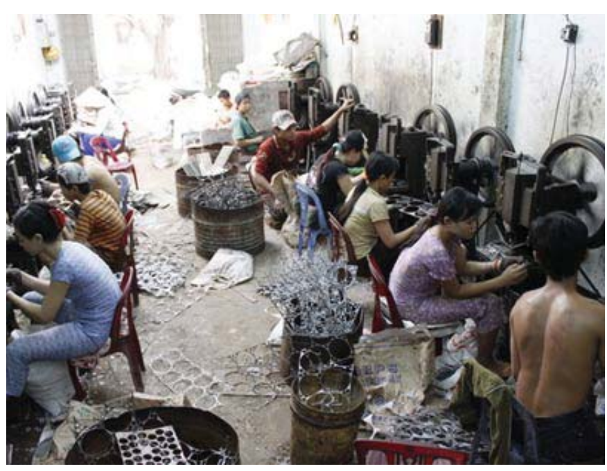
Child labor sweat shop in the Glorious workers paradise of Vietnam

In July 2012, Human Rights Watch published a new report entitled "Torture in the Name of Treatment: Human Rights Abuses in Vietnam,