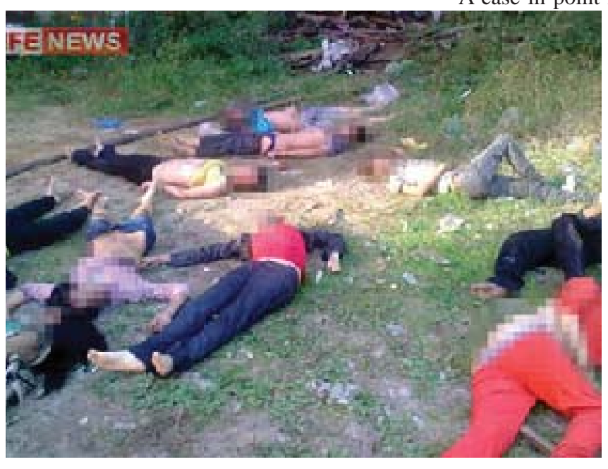
14 Vietnamese garment workers were burned to death in Russia in September 2012.

Another aspect of the human trafficking issue in recent years that deserves attention is that