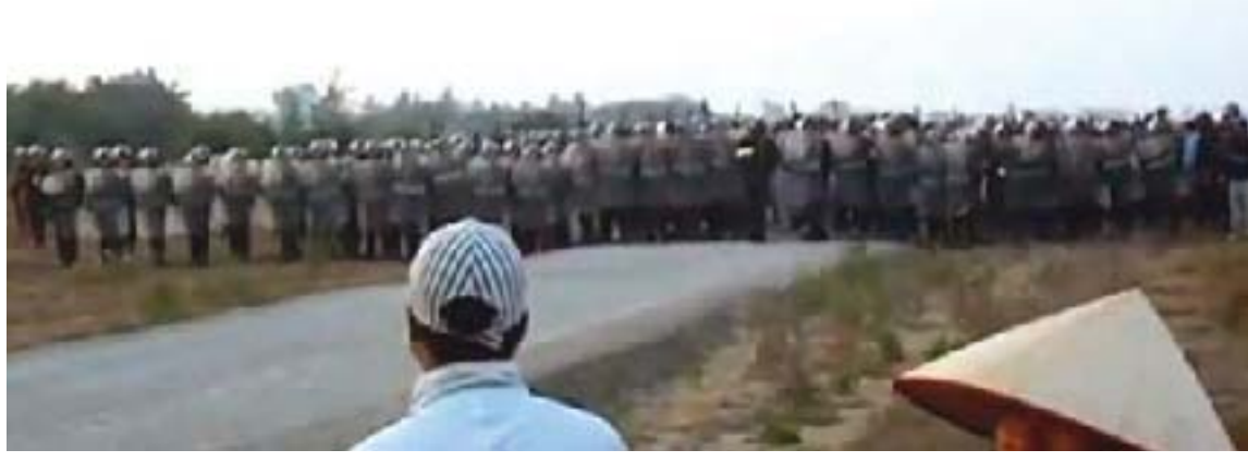
Backed by bulldozers, thousands of police, military personnel, and plain clothes security forces moved in seizing the villagers' land at Van Giang April 24, 2012.

poor farmers are reduced to dire poverty. In the past several years, the number of state officials and land speculators who have collaborated with them became billionaires at a shocking rate. This tragic situation has persisted throughout the years; however, in