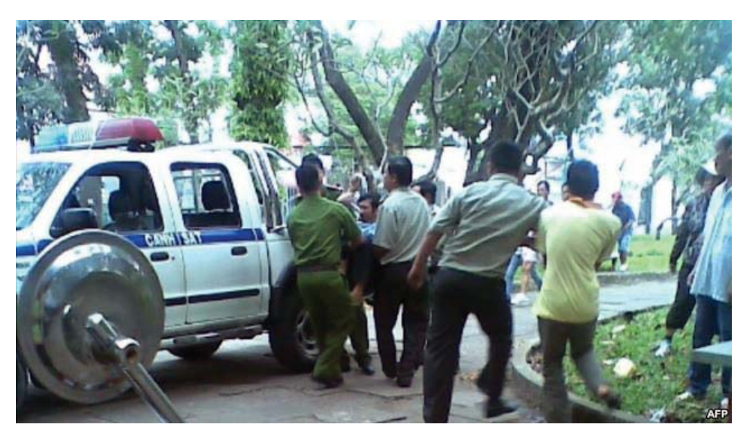
Falun Gong practitioners arrested at Le Van Tam Park on Feb 02, 2012.

7:30am, Degar Catholics from the village of Bon Kon H'Drom (commune of Dak T'Re, district of Kon Braih in Kontum province) were in the midst of having prayer and worshiping God when Vietnamese armed security forces raided them. While many were able to disperse, young children with their mothers and the elderly were not able to move quickly enough and were subsequently trampled by the security officers and struck with batons. More than 30 people were reportedly injured during the raid.<sup>12</sup>