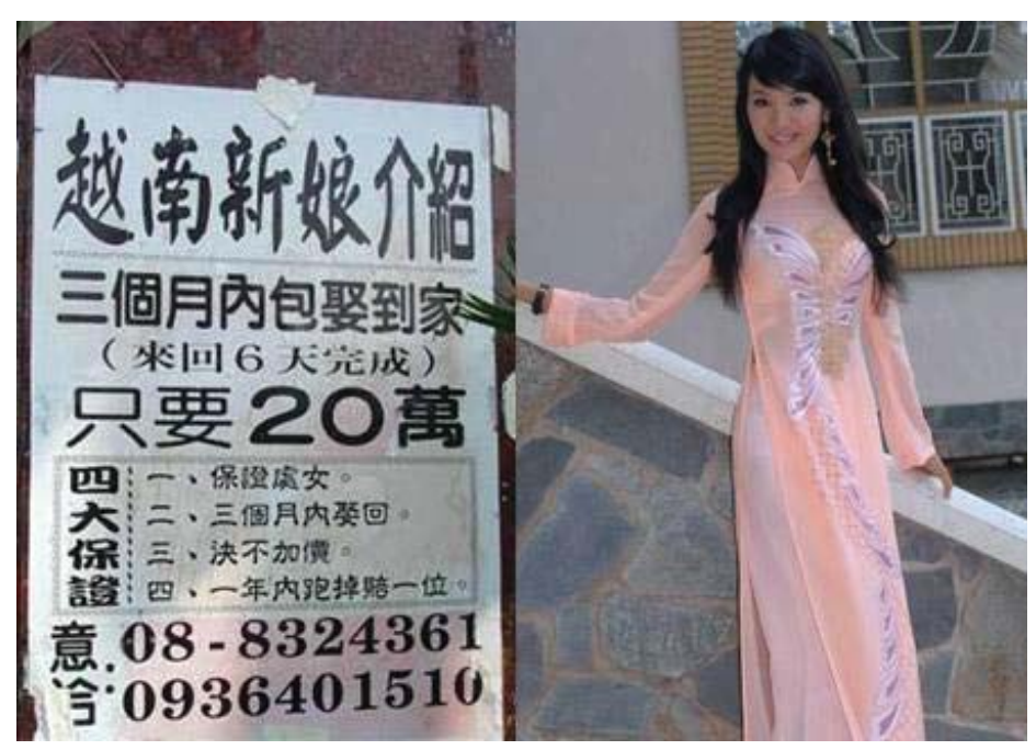
Chinese ad for mail-order Vietnamese bride: A Vietnamese bride for $5000, virginity guaranteed, delivery within 90 days, if ran away within a year, get another one for free

One should be wary of the accuracy of the statistics by the authorities. A report by the Lao Động Online dated Dec 6, 2012 showed as many as 4,000 girls who were married to foreigners in Hau Giang Province. However, the Provincial Justice Service reported only